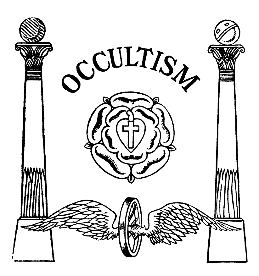
RENTS IN THE VEIL OF TIME